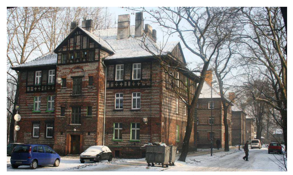
Fig. 1. Residential buildings in the settlement of Zandka in Zabrze