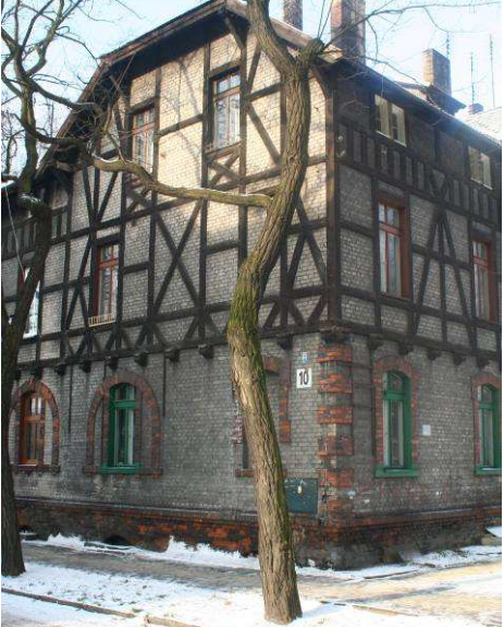
Fig. 2. Residential buildings in the railwaymen settlement in Pyskowice (left) and Zandka in Zabrze (right)

These objects were created during the periods of different, from todays, regulations on thermal insulation or lack of them. Their current state of the