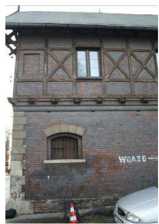
Fig. 3. Building of State Music School in Gliwice.

A large part over the years has undergone different modifications, mainly associated with the attempt to improve thermal insulation. Determination for design purposes of the current state of the thermal protection inhibits the lack of project documentation and data concerning the construction and reconstruction of individual barriers. In determining their thermal insulation, helpful is a method of thermal imaging that allows to investigate the accuracy of temperature distribution and the occurrence of, so-called, thermal defects, i. e. for example unintentional changes in the material structure of the barrier. It also allows for imaging individual thermal differences associated with the complex structure of inhomogeneous barrier. Following this study, one obtains images of temperature differences on the tested surfaces of barriers. Analysis of the results is to extract places with different colours of the image, which corresponds to the variable thermal insulation of the barrier associated with e. g. its heterogeneous structure.